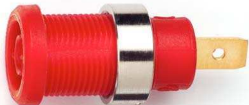
Model 72913 Panel Mount IEC61010 4mm (0.16in) Jack for Sheathed Banana Plugs

Panel Mt IEC61010 4mm (0.16in) Jack for Sheathed Banana Plugs